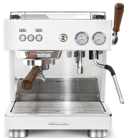
Baby T Plus