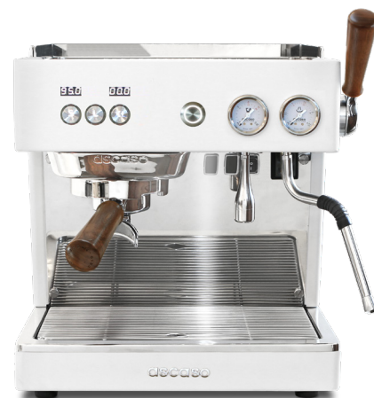
Baby T Zero